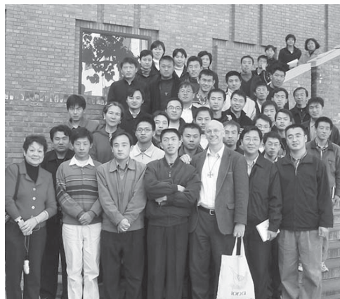
With seminarians in Beijing

Looking at the impassive terracotta soldiers in Xi’ang you feel confronted with the endless human tension between individuality and collectivity, between being ourselves and belonging to another.